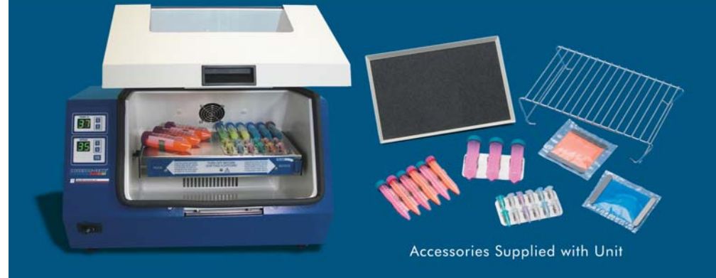
Accessories Supplied with Unit