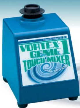
HIGH SPEED MIXER