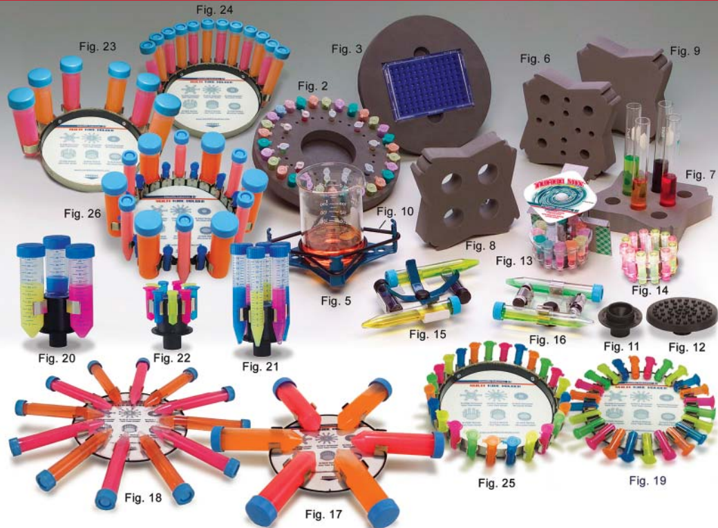
Fig. 1 Model H301 Multiple Sample Starter Set

Accessories for all Vortex-Genie® 2 mixers and Vortex-Genie® Pulse